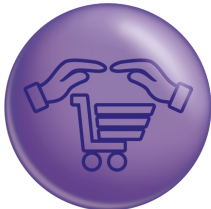
DEDICATION TO THE CONSUMER

We pursue quality in everything we do. We strive for continuous improvement in the way we operate. Unremitting attention is given to details at every stage and resources are used in the most efficient way.