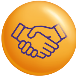
CARE FOR OUR PEOPLE

We are committed to creating a global workplace where teamwork, involvement, open communication, flexibility, and fun exist. We treat our people fairly; we value different styles, skills, experiences and backgrounds; and, acknowledge that these differences result in greater creativity and better insights. We encourage them to take initiative and expect them to approach their jobs with passion and commitment. We offer our people training opportunities and ongoing development so that each individual can reach his or her full potential.