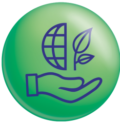
SOCIAL AND ENVIRONMENTAL RESPONSIBILITY

We are committed to creating a global workplace where teamwork, involvement, open communication, flexibility, and fun exist. We treat our people fairly; we value different styles, skills, experiences and backgrounds; and, acknowledge that these differences result in greater creativity and better insights. We encourage them to take initiative and expect them to approach their jobs with passion and commitment. We offer our people training opportunities and ongoing development so that each individual can reach his or her full potential.